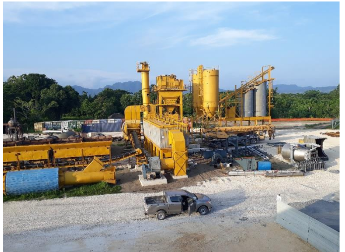
Photos of apron expansion