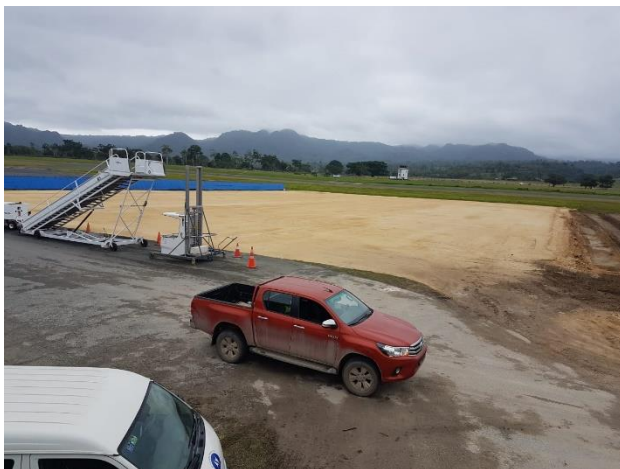
Photo of drain construction