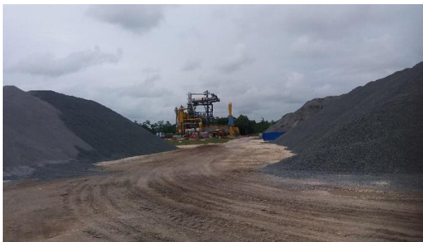
Photo of Lay down area batching plant / Lab