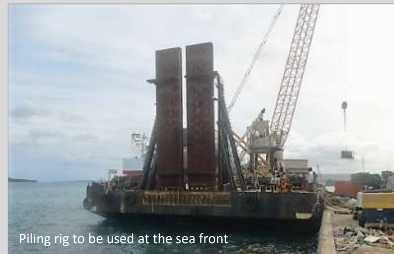
Piling rig to be used at the sea front