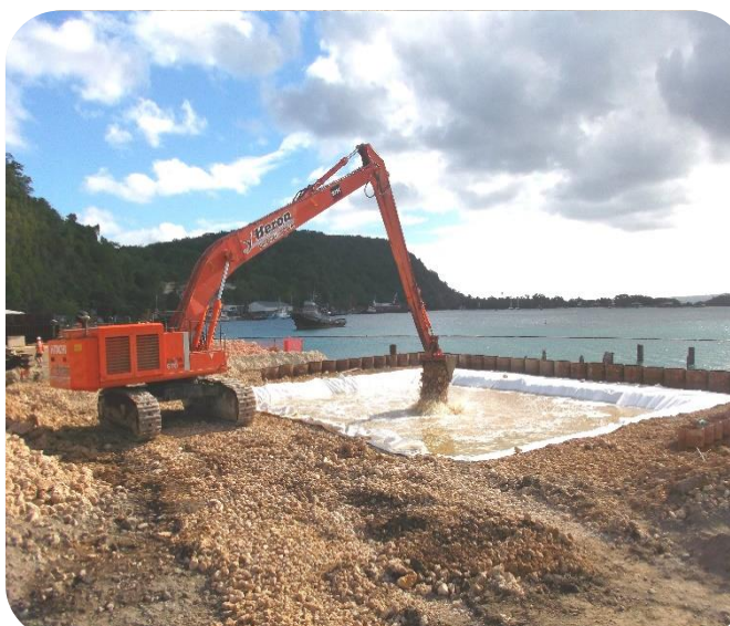
Excavation and Backfilling Works