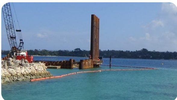
Silt Fence Installation

East and West sides of the construction site is enclosed by silt fence to prevent any turbidity from flowing out from the project boundary. Water quality monitoring is done regularly.