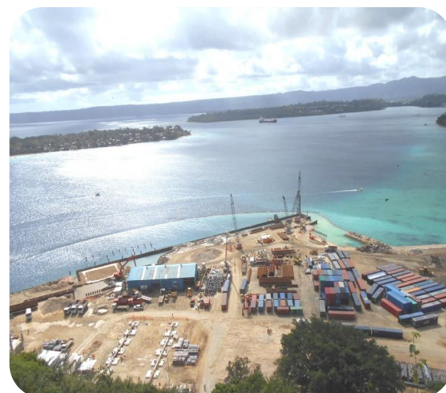
Present Site Situation