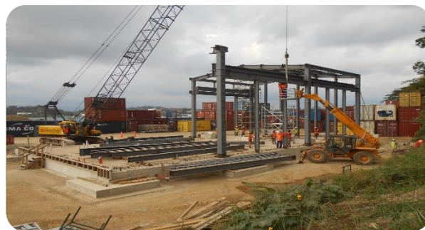
Workshop Building in Progress