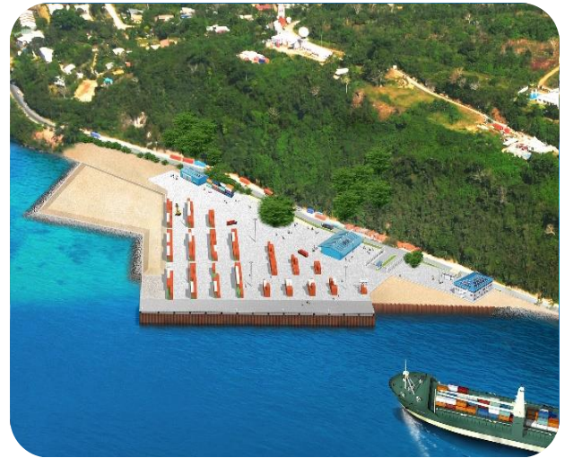
Completed Image of New Wharf

Employer : Ministry of Infrastructure and Public Utilities (MIPU) Engineer : ECOH-JV, Japan Contractor : TOA Corporation, Japan Commencement date : October 2015 Completion Date : October 2017