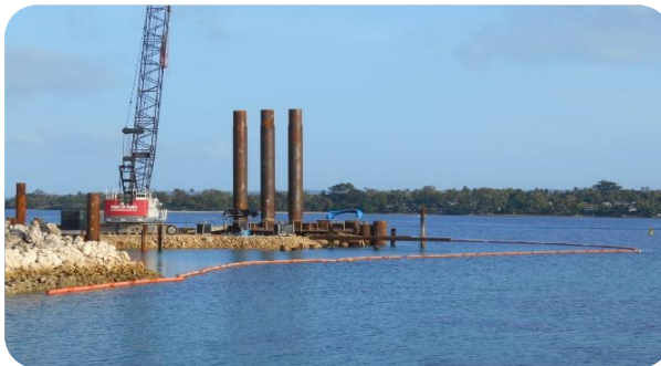
Silt Fence Installation

East and West sides of the construction site is enclosed by silt fence to prevent any turbidity from flowing out from the project boundary.