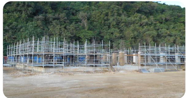
Administration Building in Progress