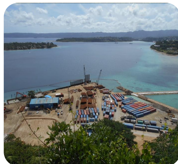
Present Site Situation