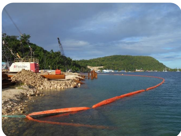
Silt Fence Installation

East and West sides of the construction site is enclosed by silt fence to prevent any turbidity from flowing out from the project boundary.